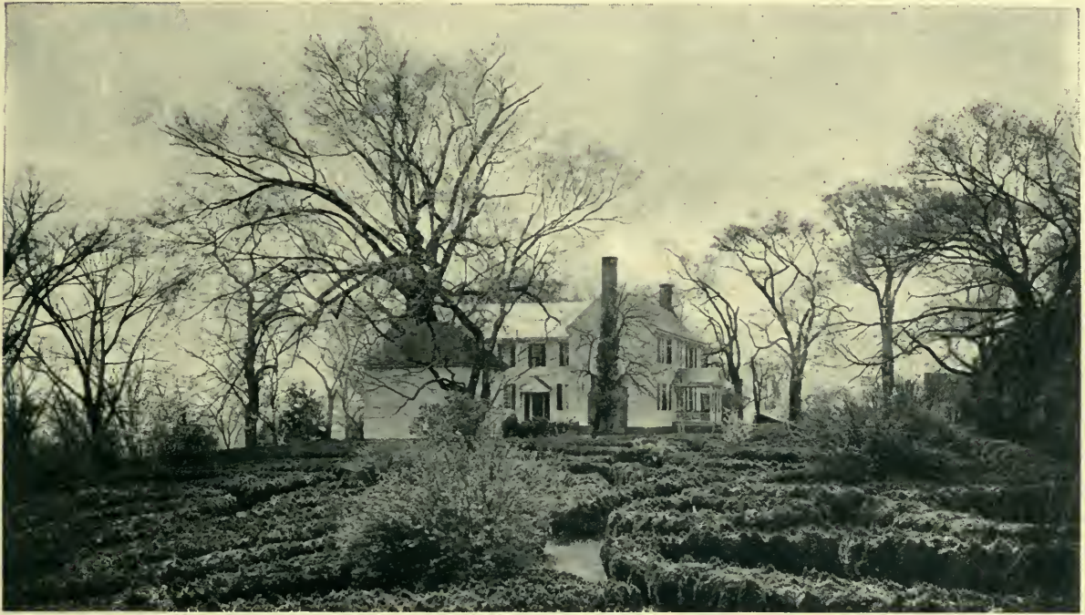
"TUCKAHOE," GOOCHLAND COUNTY, VIRGINIA. Built about 1707

The scene of Thomas Jefferson's boyhood. It is the oldest of the James River frame mansions. The house reveals an interesting plan which is \Gamma in shape: the library, drawing-room and stair hall in one wing, with the ball-room connecting the rear wing, in which the dining-room, bedroom and second stair hall are located